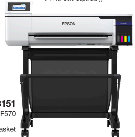
C12C933151 24" Printer Stand for F570

Easily move printer with large catch basket